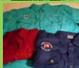
Men's Reel Legends Bonito Shirt $40.00