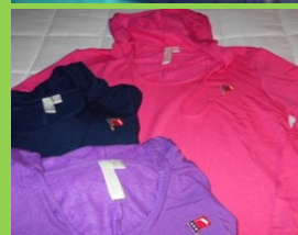
Ladies Hooded Pullover top $30.