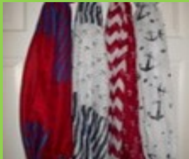
Ladies Nautical Infinity Scarves $8.00