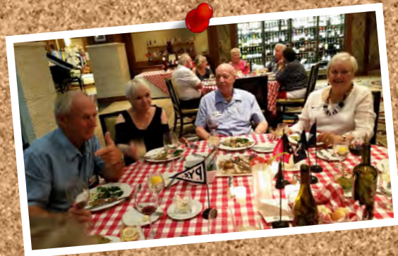
Summer Meeting Sarasota Yacht Club July 21 - 22, 2017