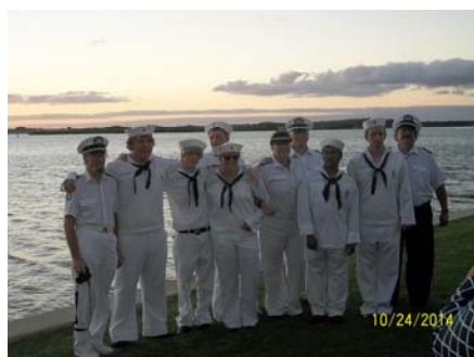
Pelican Yacht Club's Sea Scout Ship #404 looking Ship Shape in their whites