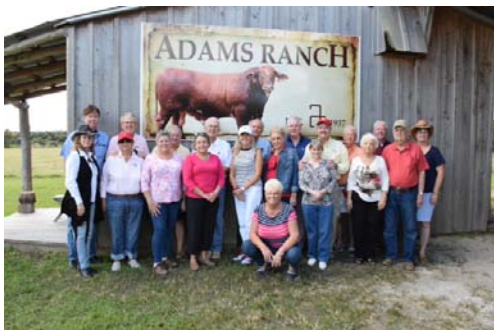
Our happy tour group.