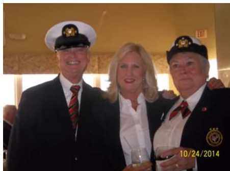
Current and past Flag Officers from Pelican Yacht Club