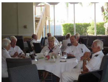
Typical informal gathering at a break during the Saturday meeting. Trying to solve the world's problems.