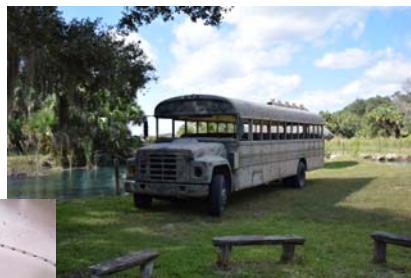
Our First Class Tour Bus.