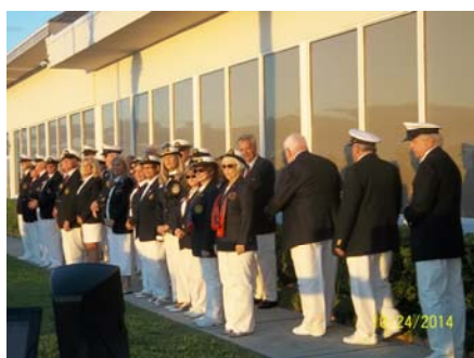
FCA Members lining up for Sundowner Ceremony.