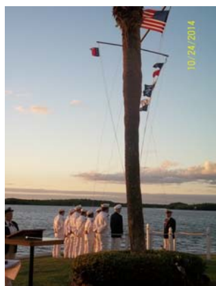
Sea Scout Ship 404 Honor Guard for Sundowner