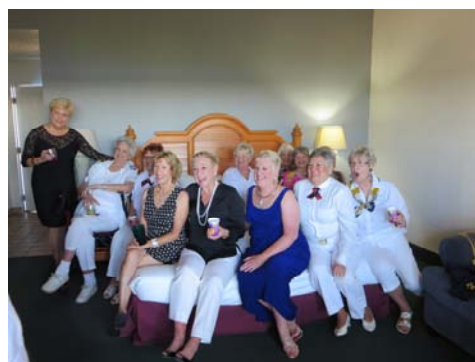
The famous "how many women on a bed" scene at the Ironing Board Cocktail Party