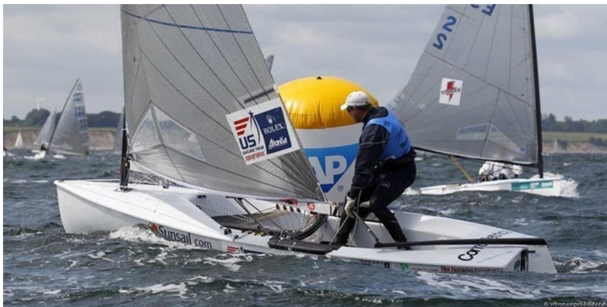
Zack Railey sailing his FINN during Olympic competition