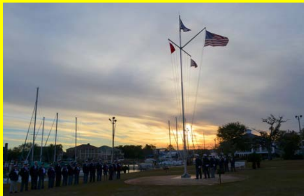
Absolutely perfect sunset for the Sundowner Ceremony