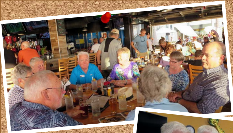
Spring Meeting Charlotte Harbor Yacht Club April 13 - 14, 2018