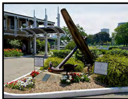
Anchor at Milwaukee Yacht Club