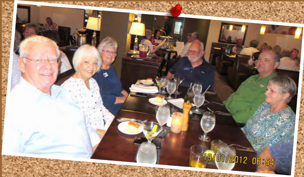
Fall Meeting Platinum Point Yacht Club October 19 - 20, 2018