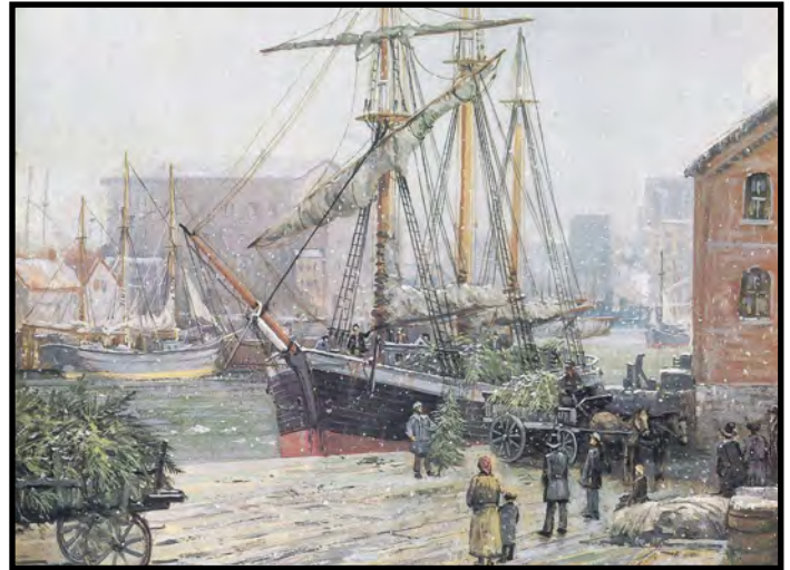
The Rouse Simmons in Chicago unloading Christmas trees.

The Rouse Simmons was a three-masted schooner famous for having sunk in a violent storm on Lake Michigan in 1912. The ship was bound for Chicago with a cargo of Christmas trees when it foundered off Two Rivers, Wisconsin, killing all on board.