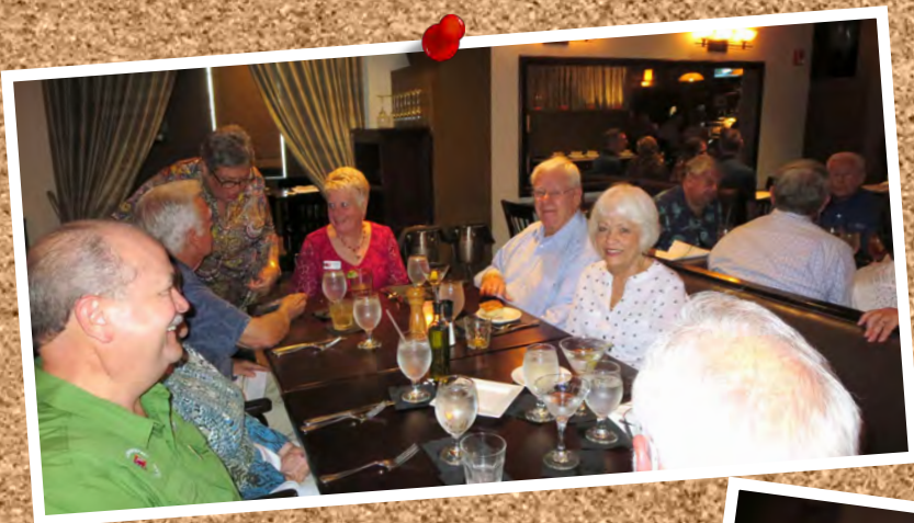
Fall Meeting Platinum Point Yacht Club October 19 - 20, 2018